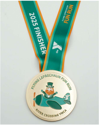
2025 FINISHER MEDAL

Flying Leprechaun Fun Runners will be awarded to all athletes as they find their Finish Line!