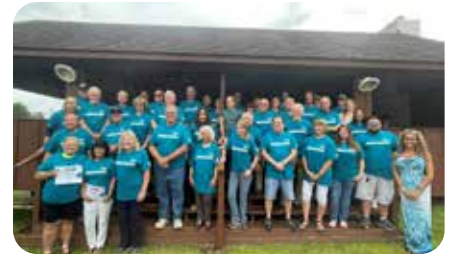
Veteran Pathway Graduation Spring 2023

On December 16, 47 military Veterans (and some spouses) attended the Veterans Wellness Pathway program graduation ceremony at the Doylestown branch. The Veterans Wellness Pathway is a 12-week program designed specifically for military veterans and spouses/partners to learn exercises, skills and techniques to build healthy mind and body habits.