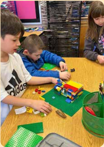
ABOVE: Students at Three Bridges School working on their 'Island Shelter' in our STEAM Survivor Club