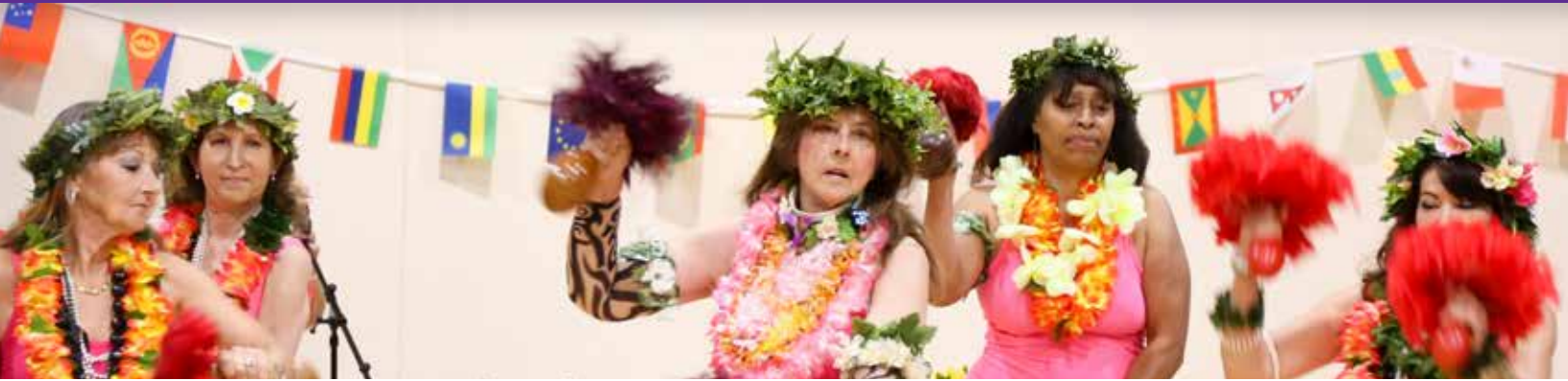
The Tehani Dance Troupe performs Polynesian dances at the Welcoming Week International Potluck.