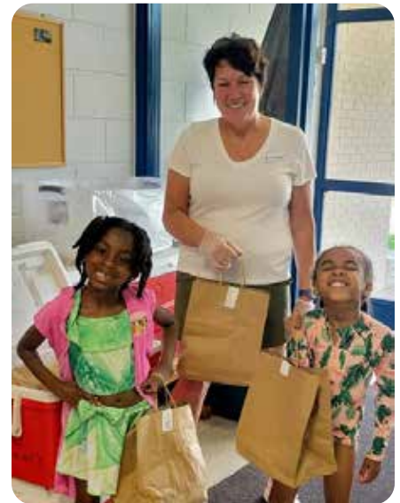
Children receiving a weekend food “backpack”

“The CACFP food program has been an absolute blessing to our family. Recent changes to the SNAP and Medicaid programs have meant that we no longer qualify for food assistance or medical assistance. The unexpected expense of acquiring new health insurance and no longer receiving SNAP benefits has been difficult for our family. Knowing that my son will receive both breakfast and lunch each day he is in care has been a huge relief for us. We are so grateful for all the help we have received from the YMCA and the CACFP program. From our entire family, Thank you to the donors who make these programs possible.”