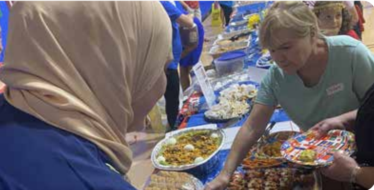
ABOVE: Attendees sample authentic Tunisian food at the Welcoming Week International Potluck.